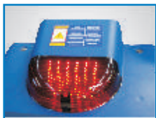
Lighting beacon and level sensor optional