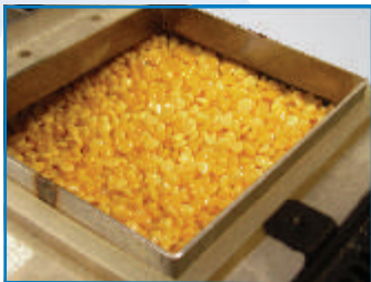
Capacities 4L, 8L, 14L