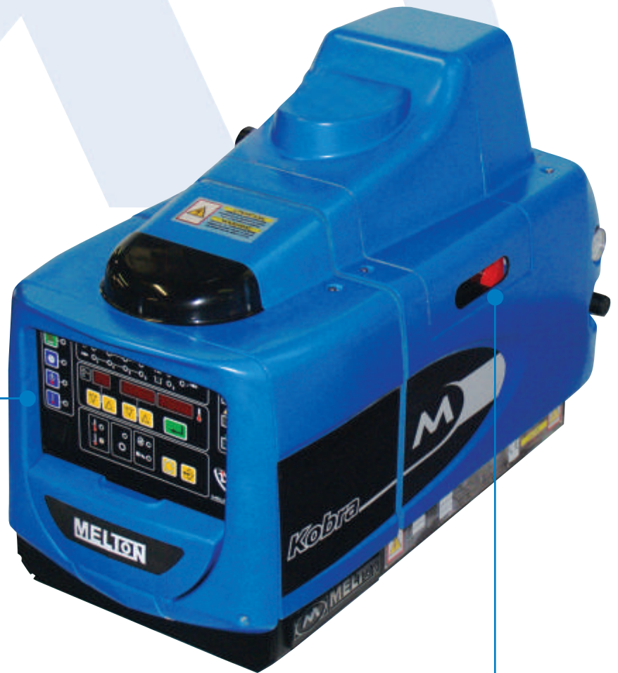
Locking lid promotes operation safety