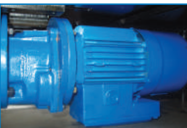
Variable speed AC motor with VFD integrated control