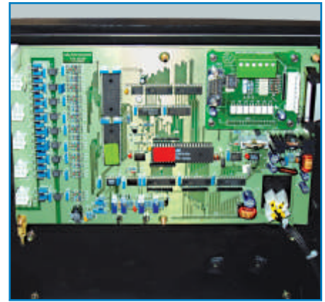
Optional Rs485 connection with modbus protocol.