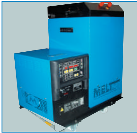
Optional caster for easy moving.