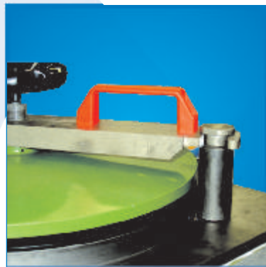
Optional air-tight opening and blowing system for PUR adhesives