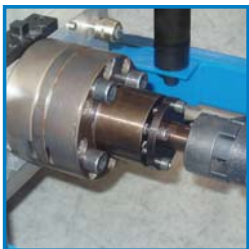
HS compatible pump to ensure stability in performance.