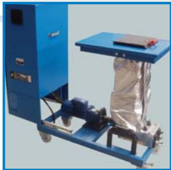
Easy access for maintenance.