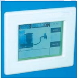
Touch screen panel for easy operation control.

PLC based control technology connected to your production line network.